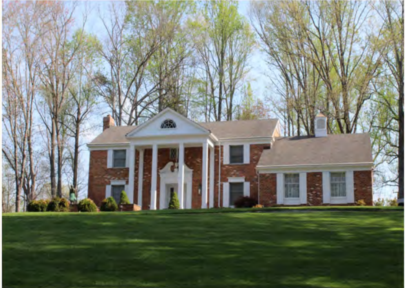
Farmington 1505 Brook Hill Lane